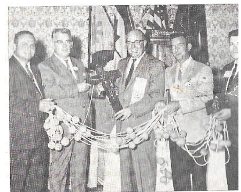
The Maryland delegates present the Florida Knights with a "traveling rosary." A similar rosary is making the prayer round in the Maryland councils.