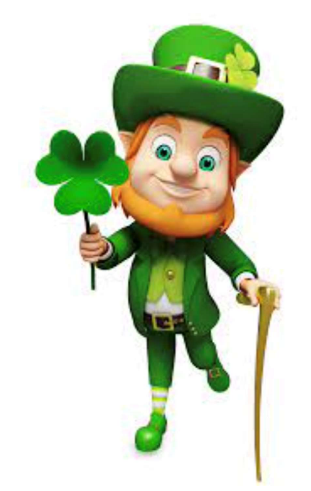
$30 includes dinner, drinks and DJ for dancing

Homemade Corned Beef and Cabbage, Colcannon Potatoes, String Beans, Dessert, Coffee, Beer, Wine, Soda